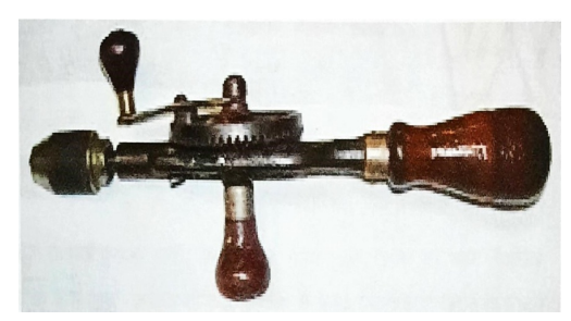
Fig 2 shows the hand drill

Over the decades, a variety of hand-powered drills have been used to accomplish various tasks. Here are a few examples, starting with the one that is most likely the oldest: Gimlet with a bow on it. Drill with a hand drill, sometimes known as a "eggbeater" drill or (particularly in the United Kingdom) a wheel braces drill Breast drills are similar to "eggbeater" drills, except that they include a flat chest piece instead of a handle. A spiral ratchet mechanism is used in the construction of a push drill. A pin chuck is a miniature jeweller's drill that can be carried around in one's pocket. An antique hand drill, sometimes known as a "eggbeater," with a hollow wooden handle and a screw-on cover that was used to store drill bits.