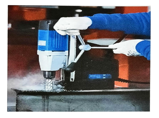
Fig 4 shows the magnetic drill machine