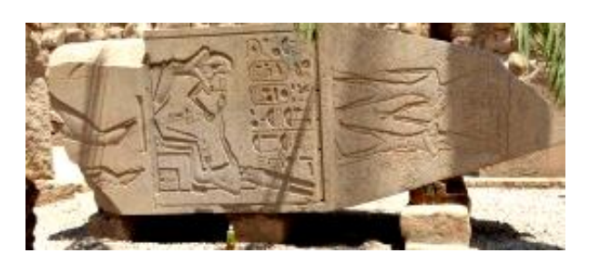
Fig.8 Granite top obelisk fragment of Thutmose III from the 18<sup>th</sup> Dynasty in Karnak [19].

- The fourth example is an obelisk top fragment of Pharaoh Thutmose III, the 6<sup>th</sup> Pharaoh of the 18<sup>th</sup> Dynasty (1479-1425 BC) laid down in the Temple of Amun at Karnak and shown in Fig.8 [19]. The obelisk fragment was inscribed using the hieroglyphic script on the face of the view shown in Fig.8 on the whole surface and on the pyramid on the top of the obelisk. Text was carved in short columns including the Cartouches of the Pharaoh.