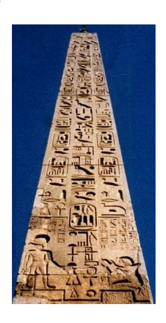
Fig.15 Granite obelisk of Seti I from the 19<sup>th</sup> Dynasty in Rome [25,26].