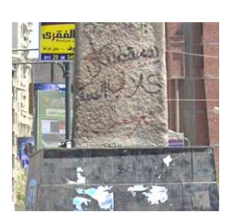
Fig.3 Granite obelisk of Senusret I from the Senusret I from the Senusret I from the 12<sup>th</sup> Dynasty in Matariya [16]. 12<sup>th</sup> Dynasty in Fayoum [17].