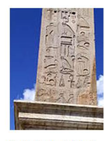
Fig.13 Granite obelisk of Thutmose III from the 18th Dynasty in Rome [23].