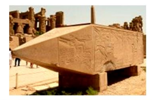
Fig.7 Granite top obelisk fragment of Hatshepsut from the 18th Dynasty in Karnak [21].

- The fourth example is an obelisk top fragment of Pharaoh Thutmose III, the 6<sup>th</sup> Pharaoh of the 18<sup>th</sup> Dynasty (1479-1425 BC) laid down in the Temple of Amun at Karnak and shown in Fig.8 [19]. The obelisk fragment was inscribed using the hieroglyphic script on the face of the view shown in Fig.8 on the whole surface and on the pyramid on the top of the obelisk. Text was carved in short columns including the Cartouches of the Pharaoh.